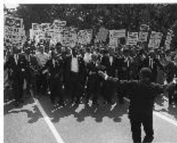
1963 March on Washington